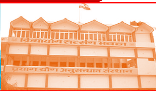
Kriyayoga Research Institute, India