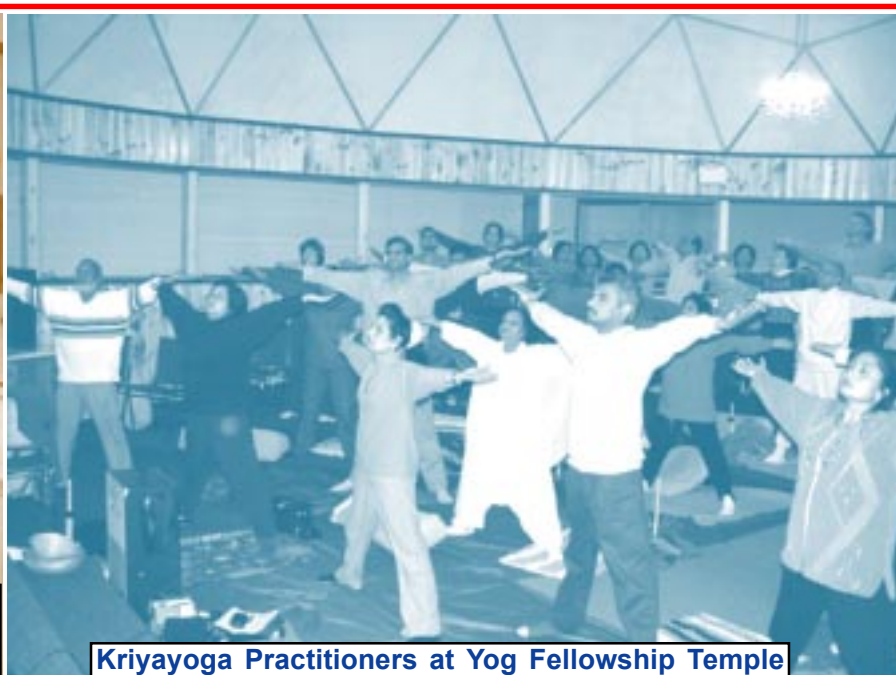
Kriyayoga Practitioners at Yog Fellowship Temple